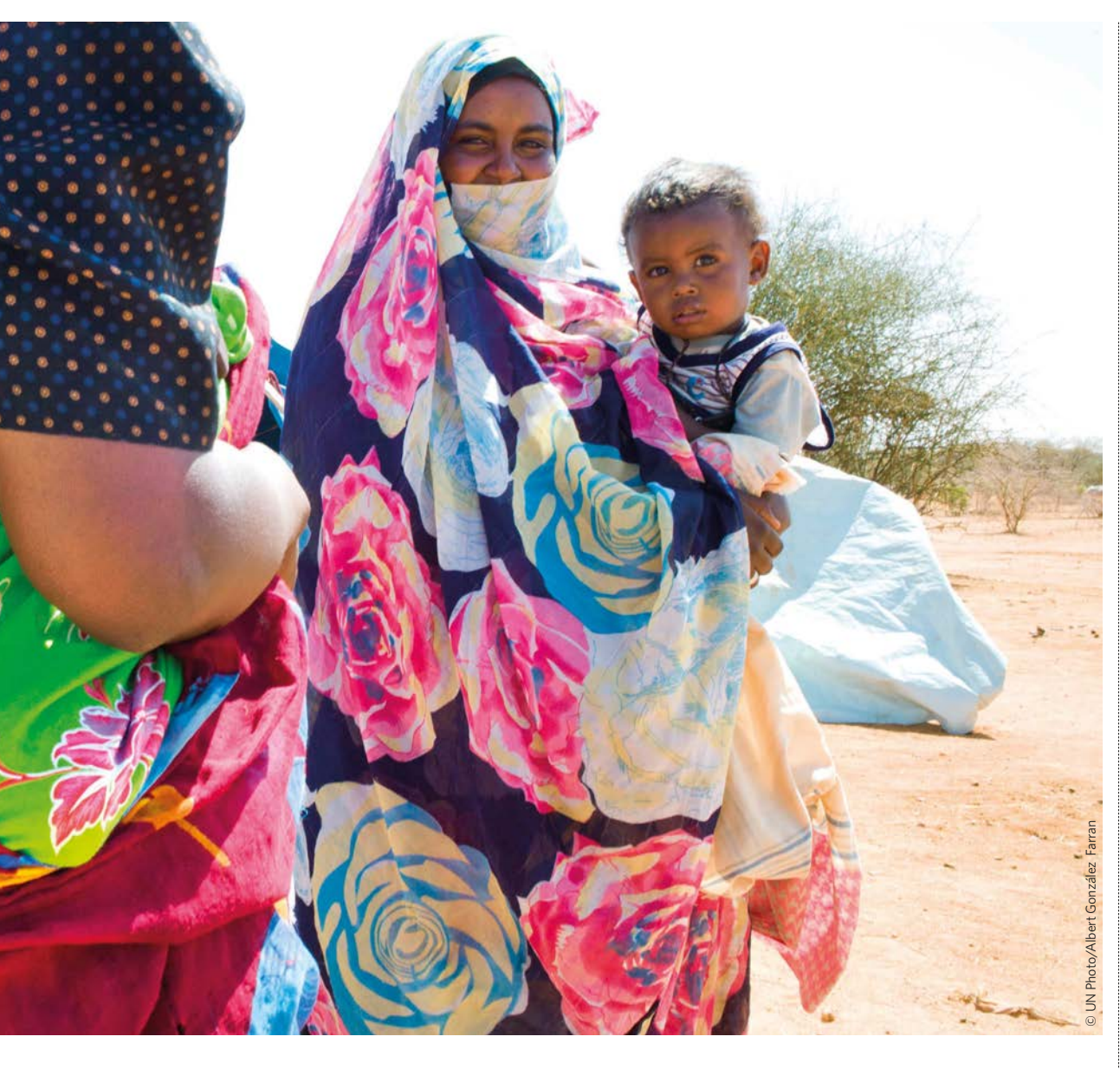
Nomadic tribes return to north Darfur after years spent as refugees. Climate change amplifies existing threats to the most vulnerable

and collectively. Fourth, plans for financial and technical support to developing countries, though still far from comprehensive, are being put into practice. Finally, real effort has been put into hammering out issues in smaller groups ahead of the Paris summit.